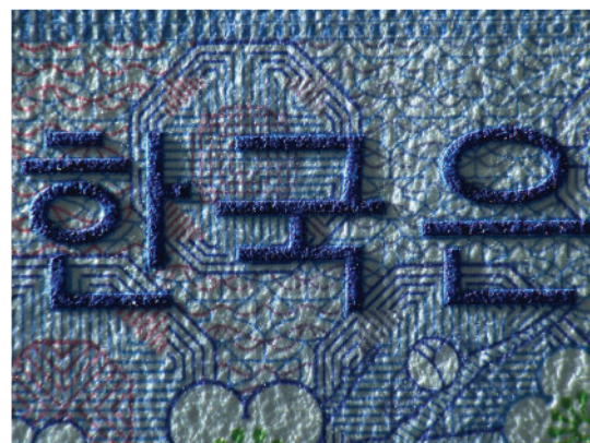
VSC: Precision Imaging Technology