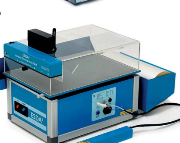
Foster & Freeman Ltd reserve the right to alter the specification

ESDA®2 is designed for examining all types of documents up to A3 size and is supplied with one reel of imaging film, cascade developer, 50 toner pads, a pack of fixing film and document humidifier. Foster & Freeman are always pleased to offer advice, training or routine equipment maintenance, and ESDA®2 is just one of a range of innovative instruments available to forensic science laboratories for improving the quality of evidence.