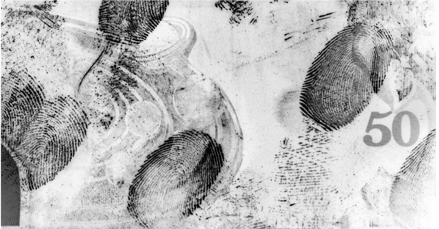
Fingermarks on a polymer banknote, developed using Cyanoacrylate