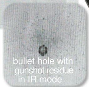
bullet hole with gunshot residue in IR mode

Attestor Forensics' SCENEview SV700 is the perfect tool for the search and documentation of blood spatter patterns at a crime scene. Due to its modular and expandable design, it is also perfect for other types of evidence, like other body fluids.