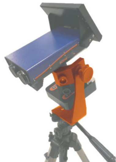
TA 800 Tripod Adaptor