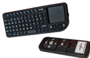
RCB & RCA 800 Basic & Advanced Remote Controls