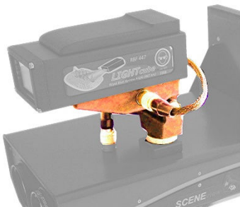
Hotshoe Adaptor For mounting LIGHTcubes