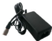
SVPWR 800 Mains Power Adaptor