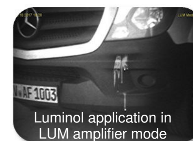
Luminol application in LUM amplifier mode