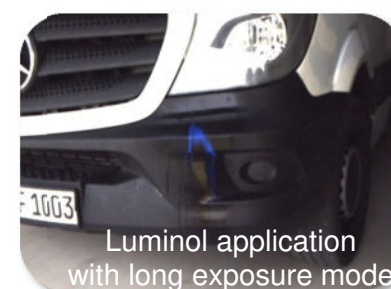
Luminol application with long exposure mode

Our solution to this is the SV800 model, with an additional integrated ambient light amplifier camera, specifically designed to be sensitive to this type of light. Optimal search results are possible even when the crime scene cannot be darkened perfectly and when the reagent is so faint that it cannot be seen with the naked eye. Less chemical developer being needed for photography means the possibility to repeat and reproduce the effects for a subsequent documentation and a lower risk of damaging evidence.